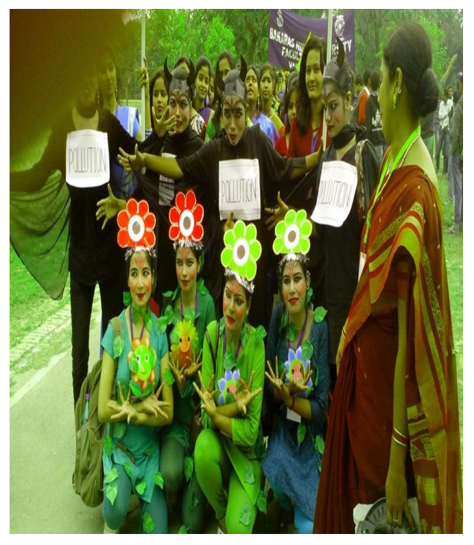
Students in Spandan Procession at BHU