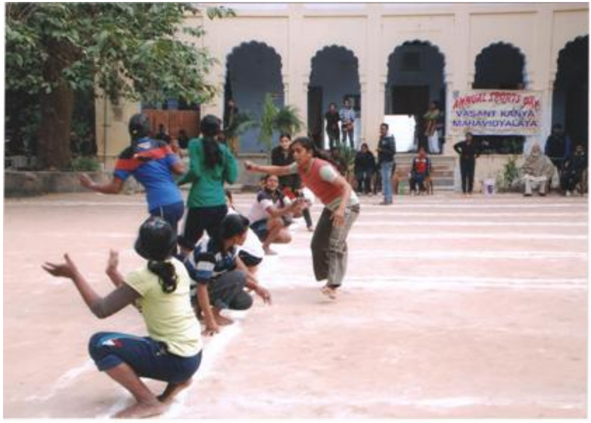
Annual Sports Day (2013-14) - Kho-kho.