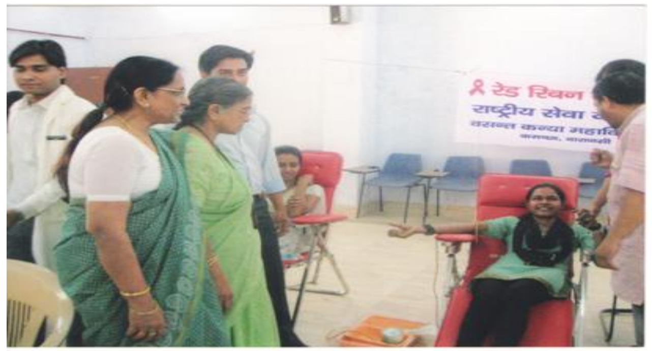
Students donating blood as a part of NSS activity under Red Ribbon Club